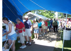
Rhubarb "Tasting Tent"

10 am- 2 pm Sample everything from Rhubarb Pie to wine at the "Tasting Tent" under the Big Blue Tent in Central Park